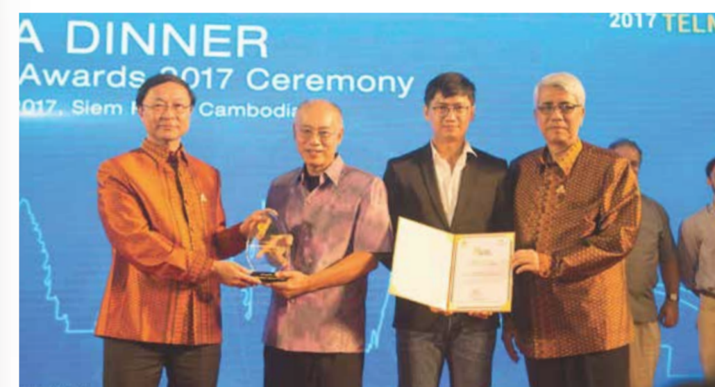
Confirmation of PODD Social Impact ASEAN ICT AWARD granted by DE Minister Dr. Pichet Durongkaveroj CSR - Bronze, Siem Reap 2017

Data submitted to PODD may soon be used to produce a simulated epidemic curve and predict disease scenarios. The early detection of one case of foot-and-mouth disease prevented nearly $4 million in economic losses. PODD volunteers are also using the system to report other hazards, including fraudulent medication sales, landslides, flash floods, smoke and forest fire. In July 2016, Chiang Mai University transferred ownership of PODD to the Chiang Mai government, with plans to expand to Chiang Rai and Khon Kaen provinces. Authorized local government personnel are trained in the operation of the PODD "dashboard", which allows them to monitor the performance of volunteers and inform relevant parties at the community level about responses to outbreaks and other situations.