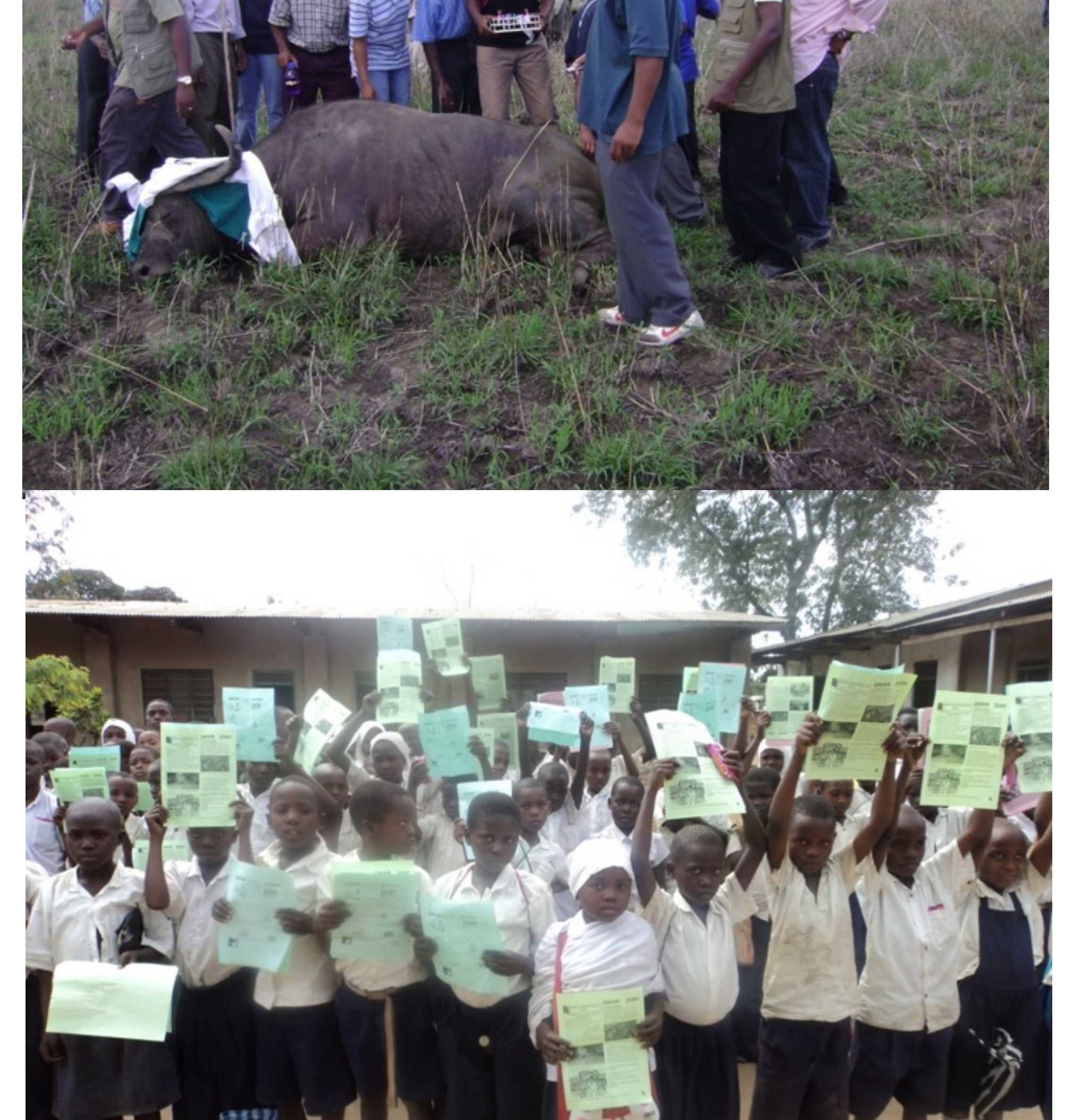
Figure 3: Training of University students (Medical, Veterinary, Wildlife and Environmental Health students together) on Zoonoses and AMR in Mikumi National Part which is part of Kilosa Demonstration Site in Tanzania. Picture: Testing Tuberculosis in Immobilised Buffalo

Community domain: There are affirmative actions towards Training of One Health Workforce (OHW) in particular para-professionals (diploma and certificate holders) that work at community level. The University One Health Student Clubs actively get involved in sensitisation and education of primary school children about zoonoses and AMR. The same club also use OH approach and service learning models to offer public health services at community levels.