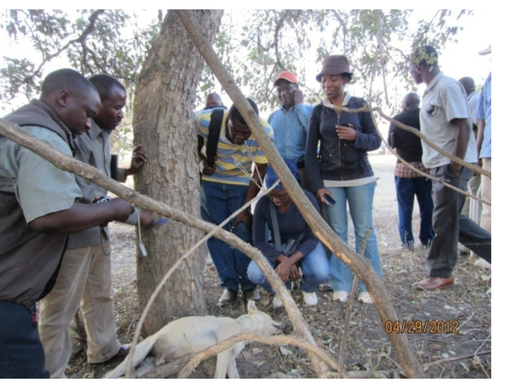
Figure 5: Training of University students (Medical, Veterinary, Wildlife and Environmental Health students together) Using Service Learning model (Training while vaccinating dogs against Rabies in Kilosa One Health Demonstration site in Tanzania

Figure 4: Training of Primary School Pupils on EPT, Zoonoses and AMR in Mikumi National Part which is part of Kilosa Demonstration Site.